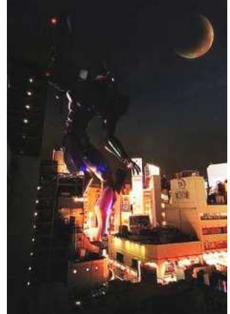
A scene from Evangelion: 1.0 You Are (Not) Alone where an Evangelion is the only protection Earth has against those dangerous beings known as 'Angels'.

It is the year 2015 and Earth is recovering from a global calamity that killed half the world's population. The Second Impact, said to be a meteor that struck the earth. also