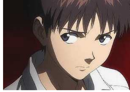
Shinji Ikari pilots an Eva and desperately needs therapy.

Incidentally, there are rumours that the last film will have a completely different ending from the series. An Evangelion: 2.0 release is planned for this year in Japan.