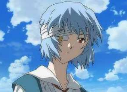
The quiet and withdrawn Rei Ayanami

Shinji, for instance, is a favourite target for Evangelion -bashers who cannot stand his whining over his worthlessness and the piloting of his Eva. (But do you blame an emotionally unstable kid for behaving as he does being forced into a machine to tackle something that could kill him?)